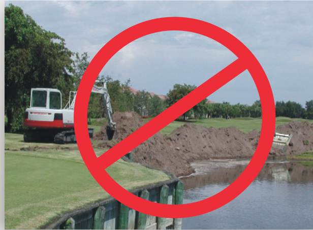
Traditional Methods for installing tie-backs involved tearing up fairways, greens or landscaping. Plus, there are trucks and heavy machinery coming on to your course.

DSMS provides a cost effective alternative to complete retaining wall replacement. The system extends the life of the failing walls and diminishes the need for costly new wall construction.