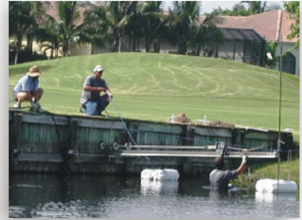
With DSMS technology ... Installations are performed from the waterside of the retaining wall. There's no costly damage to your course and installation time is MUCH quicker.

Threaded end provides "dynamic" advantage by allowing the tie back to be removed and adjusted if necessary.