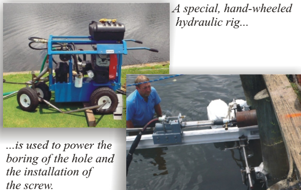
A special, hand-wheeled hydraulic rig...

Installations are performed from the water side of the retaining wall, thereby eliminating costly damage to golf course grounds and irrigation systems. A 3 ft. long wheeled hydraulic rig is the largest piece of equipment needed on the property. The rig bores a hole and drives the 14 ft. Stainless steel screws used to secure the wall and prevent further movement.